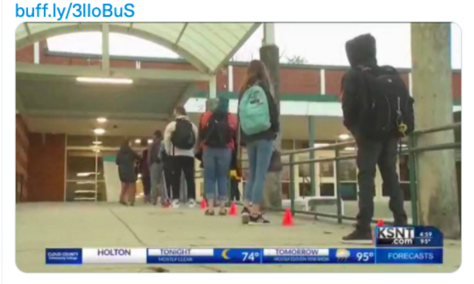
5:14 PM · Aug 7, 2021 · Buffer

"The latest numbers from the American Academy of Pediatrics (@AmerAcadPeds) show coronavirus cases in children are up 84 percent compared to the previous week. That's 71,000 kids testing positive." —>