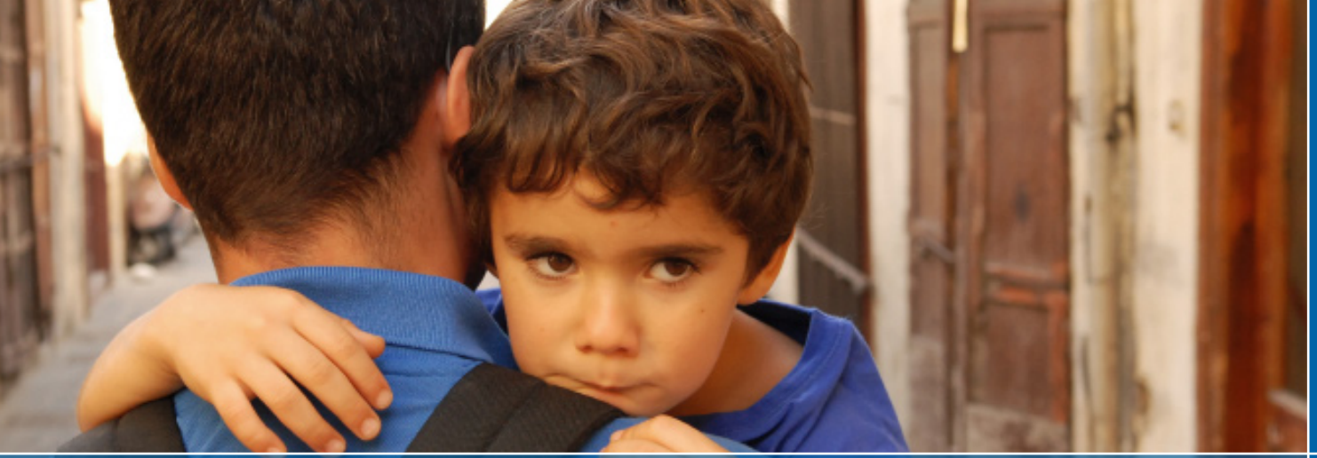
Caught Between Systems: The Intersection of Immigration and Child Welfare Policies